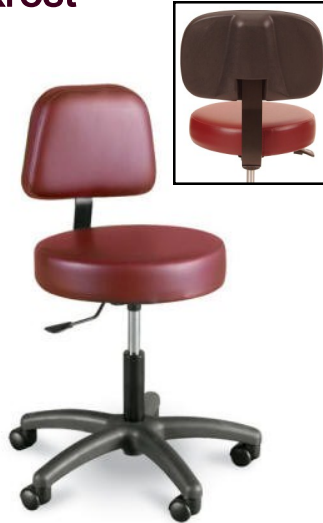
Durable Black Back Cover